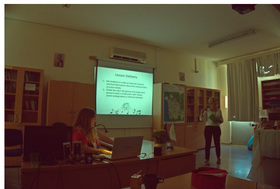
Presentation of music project

Give me a second To introduce myself I'm the shiny bismuth I love cosmetics and there you will find me sitting on my chair