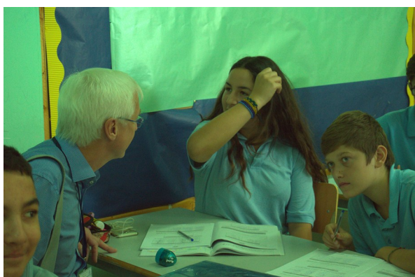
Talking in German

We attended a lesson where immigrants and refugees were taught, there were two Russian-speaking boys: one- from Russia, another one- from Ukraine. They liked their school very much, but the Greek Language is quite difficult for them to learn, despite of the teachers' support.