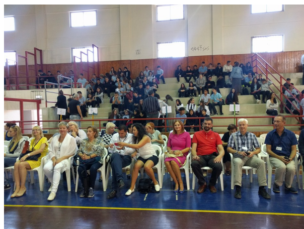
Greece celebration for "Ohi Day"

A big honor for all project group was invitation to school event devoted to Greece "Ohi Day". The word 'Ohi' simply means 'No'. It is the word Greek Prime Minister Ioannis Metaxas used in 1940 to Mussolini's spokesperson when asked if Axis forces could use Greek territory to gain access to areas of Europe not already occupied by Hitler and Mussolini. Metaxas stalwartly said 'No!'. Cities and towns across Cyprus and Greece celebrate "Ohi Day" with student parades that close down most centers. In Nicosia, Cyprus, school students and veterans march in a parade and carry banners and the flags of Cyprus and Greece. At school we could see that all students, teachers knew respected Greece history and were proud of their country.