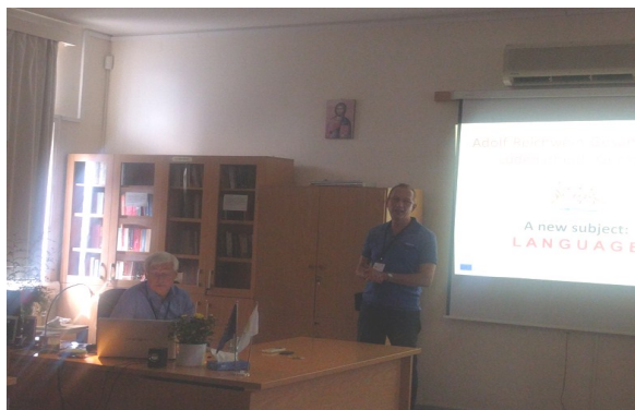
Presentation of Germany team

Germany presented the approach " Teaching language " to teaching spelling to refugees. It is a special lesson "Language" which was introduced at Städtische Adolf-Reichwein-Gesamtschule several years ago and helped the students with migrant background to finish successfully and go onto the next higher level. Lessons in a new subject called "language", where the teachers try to enhance the linguistic competence in the German language of our younger German and multicultural students, who often have difficulties in understanding texts/producing texts.