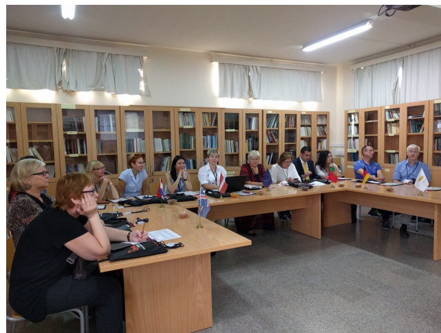
At the meeting