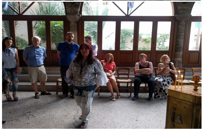
Nicosia old town tour

A big honor for all project group was invitation to school event devoted to Greece "Ohi Day". The word 'Ohi' simply means 'No'. It is the word Greek Prime Minister Ioannis Metaxas used in 1940 to Mussolini's spokesperson when asked if Axis forces could use Greek territory to gain access to areas of Europe not already occupied by Hitler and Mussolini. Metaxas stalwartly said 'No!'. Cities and towns across Cyprus and Greece celebrate "Ohi Day" with student parades that close down most centers. In Nicosia, Cyprus, school students and veterans march in a parade and carry banners and the flags of Cyprus and Greece. At school we could see that all students, teachers knew respected Greece history and were proud of their country.