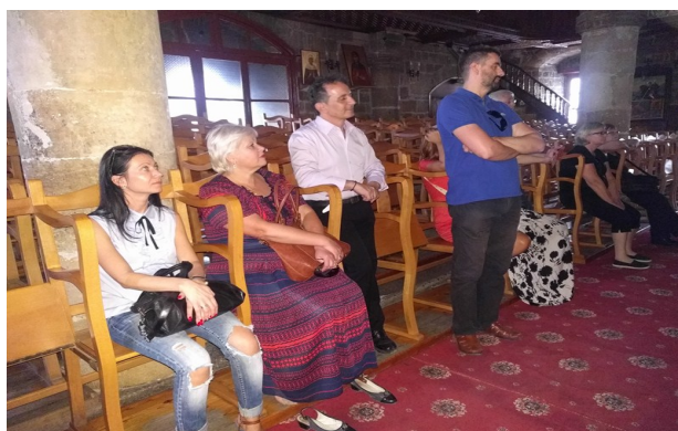
Nicosia old church 'Tripiotis'