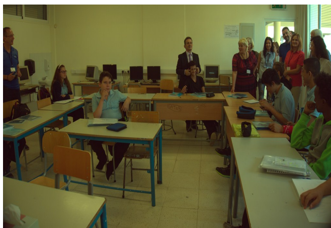
Visiting the immigrants class

We attended a lesson where immigrants and refugees were taught, there were two Russian-speaking boys: one- from Russia, another one- from Ukraine. They liked their school very much, but the Greek Language is quite difficult for them to learn, despite of the teachers' support.