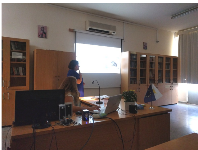
Presentation of Cyprus team

Drama in Education refers to artistic activity where participants can role-play situations, act out imaginary scenarios, or demonstrate fictitious images for the purposes of insight and growth. All drama activities lead to better understanding of poem idea, personal development and acquiring of language.