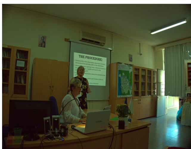
Presentation of Latvia team

Teachers can work with students individually at the computer or using an interactive white-board frontally.