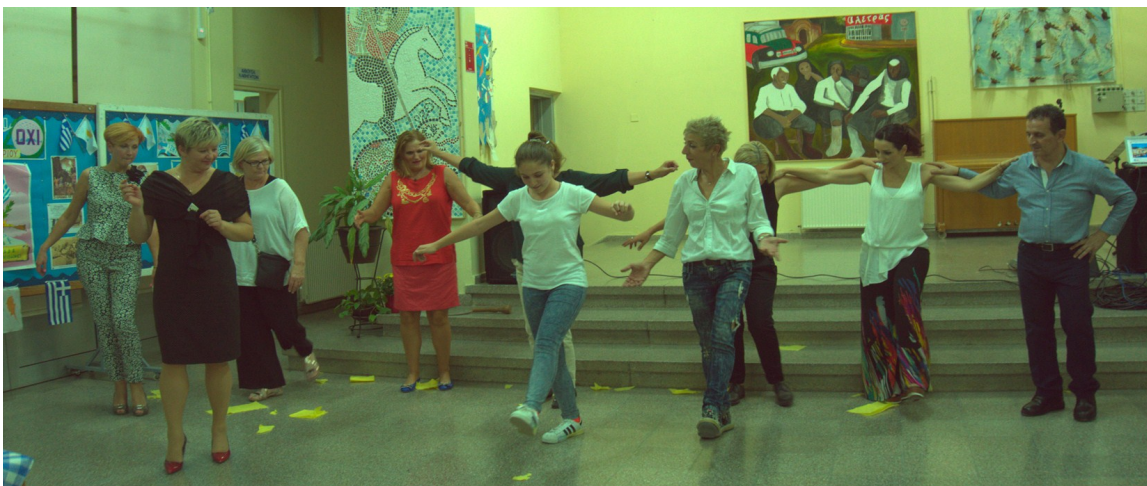
Friendship dinner at school