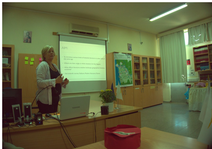
Presentation of Iceland team