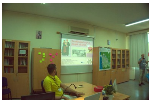
Presentation of Croatian team

The approach got an award for "language sensitive teaching" and the subject "language" that was developed at Städtische Adolf-Reichwein-Gesamtschule is now standard at many other schools. Both should help the students with essential basic linguistic qualifications that will make it easier for him to read, understand and produce texts of all kinds in all subjects.