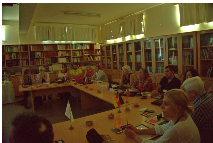
At the meeting

The participants from Iceland showed us part of their work on Icelandic literature and literary tourism.