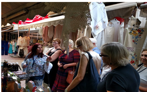
Nicosia old town market

In the evening, Cyprus team hosted a welcome dinner in a traditional tavern (restaurant) in the heart of the city.