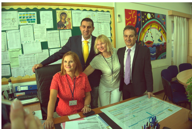
Our Erasmus+ headmasters

The school has many premises, nice large classrooms, wide corridors and an amazing hall with a stage, where students can have a rest or spend time with their teachers having some rehearsals if they are necessary. All doors are open so students can go out and breathe fresh air, of course, the weather suits for this kind of activity. Students have a school uniform, they look nice and it unites them, identifying with the appropriate school. At PE lessons boys and girls do sports separately, it also gives teachers the opportunity to realize their teaching program more precisely.