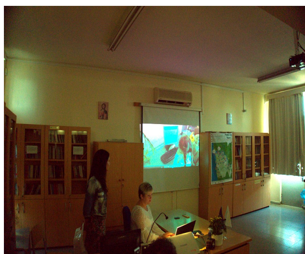
Presentation of Latvia team